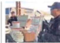
Agents display the 254 pounds of fentanyl seized in an 18-wheeler at the Mariposa port of entry during a news conference at the port on Thursday.