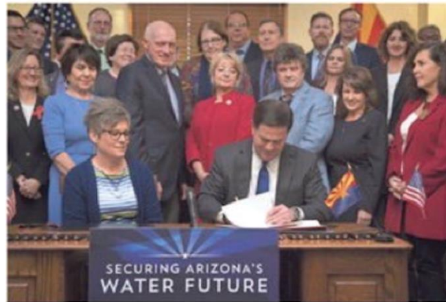
Secretary of State Kate Hobbs (center), policy advisers and lawmakers watch Thursday evening as Gov. Doug Ducey signs legislation allowing Arizona to join the three-state Drought Contingency Plan.