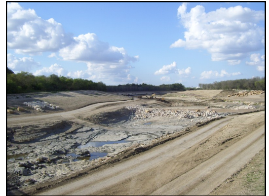
Photo: San Antonio River Improvement Project, Mission Reach , San Antonio, TX.

The first position supports States’ rights to natural surface water flows. It says that the WSWC “urges the Army Corps of Engineers to recognize the legal right of the States to the development, use, control, distribution and allocation of the States’ surface waters.... [T]hat any policy of the [Corps] to require storage contracts to access natural flows within a reservoir boundary would be a violation of the States’ right to develop, use, control, and distribute surface water.... [T]hat the [WSWC] opposes any and all efforts that would diminish the primary and exclusive authority of States over the allocation of surface water.”