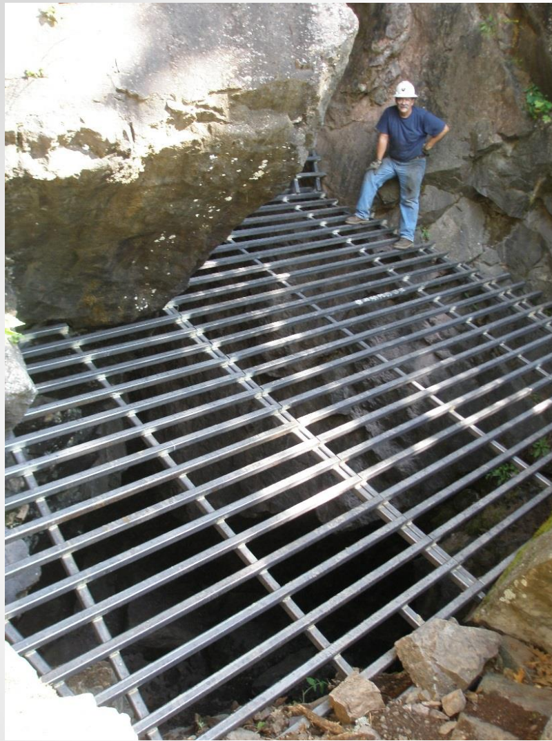
For Bats Living on a Mountain Top in Michigan (Ottawa NF)