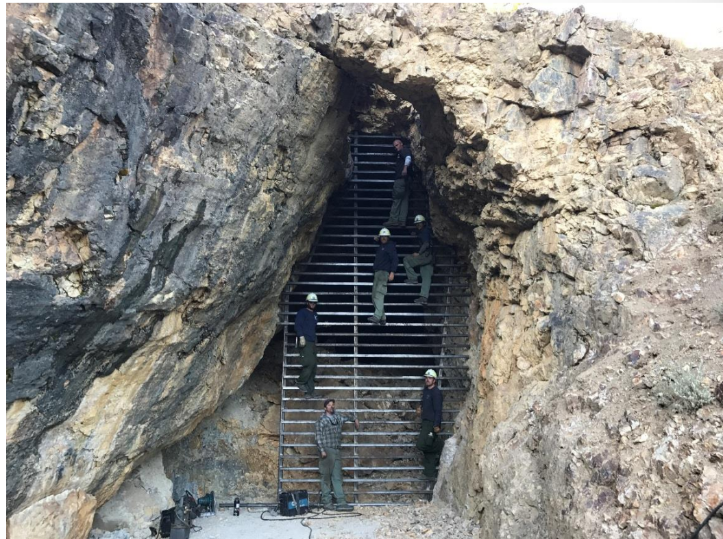
For Bats Living in a High Rise in Idaho (Salmon-Challis NF)